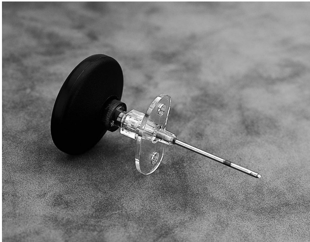
Figure 2. Cook disposable intraosseous infusion needle with the Dieckmann modification and standard hub design (Cook Medical). Specialized intraosseous needle with circular handle to facilitate placement and stylet to prevent obstruction by bone spicules. When the circular handle with stylet is removed, the hub allows connection to standard IV tubing via the Luer lock.

having stylets to prevent obstruction, these needles have specialized handles that help in their successful placement and short needle shafts to minimize the risk of dislodgement.