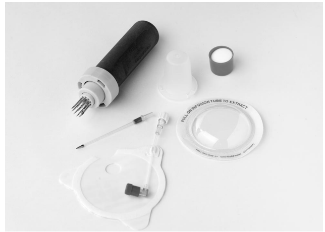
Figure 6. First Access for Shock and Trauma Device (FAST1®).

In addition to the devices that are designed to enter the marrow cavity of the tibia, there is a device (the FAST1® [First Access for Shock and Trauma], PYNG Medical, Vancouver, BC, Canada) that is specifically designed for sternal use in adults but has been approved in adolescents down to 12 yr of age. The FAST1 consists of a set of needles, catheters, and stabilizer points that determine or measure the depth from the skin surface to the periosteum of the sternum