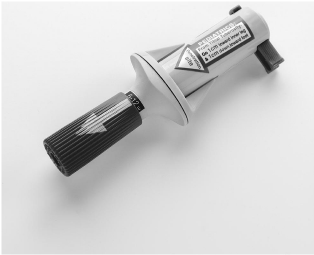
Figure 5. Pediatric version of the Bone Injection Gun (B.I.G.) (WaisMed).

The Bone Injection Gun (B.I.G., WaisMed, Kansas City, MO), introduced in 2000, was the first automatic IO device. The gun is positioned 90° to the skin and held firmly with 1 hand while the other hand pulls out the safety latch. The B.I.G. then uses a “position and press” mechanism with a spring-loaded device that actively penetrates the cortex when a button is pushed (Fig. 5). Beyond simply applying the B.I.G. firmly against the skin, no additional force is needed before triggering the device. Once the IO space is penetrated, the device is removed, and a safety latch slides over the needle to keep it securely placed before taping.