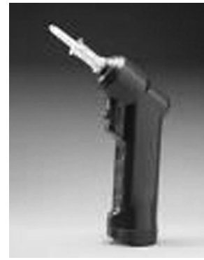
Figure 3. EZ-IO device (Vidacare).

In addition to the spinal needles, basic bone marrow biopsy and aspiration needles such as the SurFast (Cook Critical Care, Bloomington, IN) and the basic Jamshidi needle (Baxter Healthcare, Deerfield, IL) are considered manual devices that require the operator to exert manual pressure to penetrate the periosteum and enter the marrow cavity of the bone. Another frequently used manual device is the Cook Disposable Intraosseous Infusion Needle with the Dieckmann modification and standard hub design (Cook Medical, Bloomington, IN) (Fig. 2). All of these bone marrow biopsy and aspiration needles have the desired features as listed above that include a stylet and handle for ease of insertion.